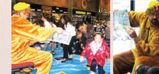
who is this guy and what has he done to the children?

Forget the 1am starts, for the wildest gigs in town, HB Williams Memorial Library Holiday Programme and the weekly toddler time sessions can't be beat.